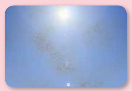
2. Daylight triggers the Pilkington Activ™ coating.