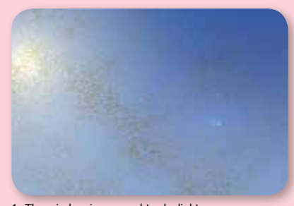
1. The window is exposed to daylight.

The coating is integral to the glass – it will not flake off or discolour, so it can only be affected if the surface itself is damaged; for example, by pointed objects, abrasive cleaners or steel wool.